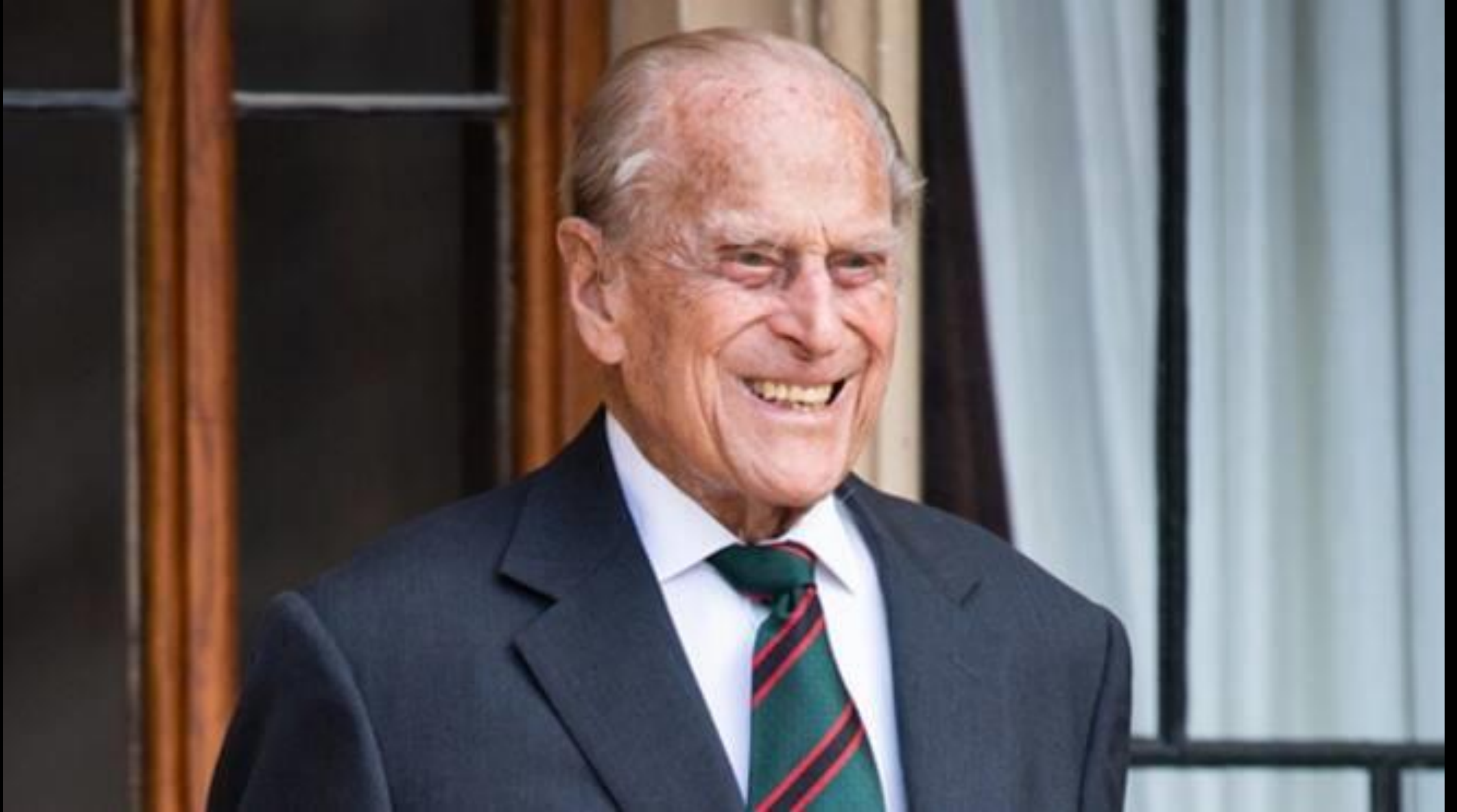
Prince Phillip, the Duke of Edinburgh, 10 June 1921 – 9 April 2021