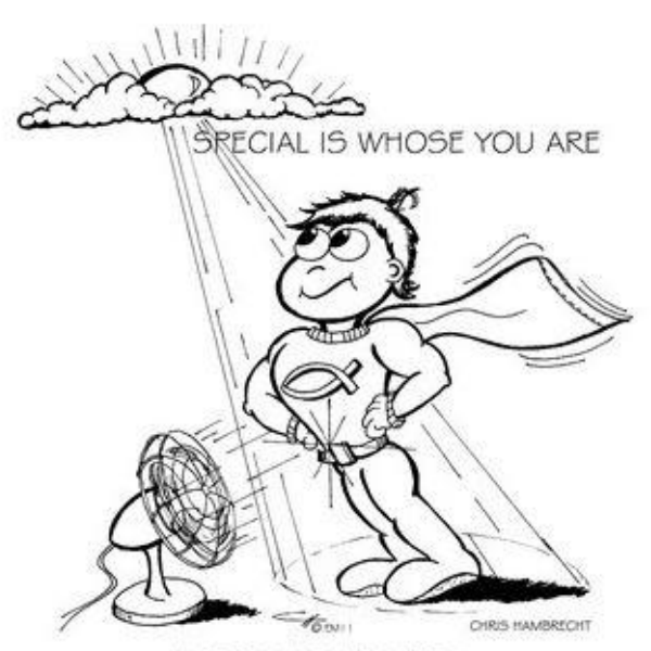
NOT WHO YOU ARE

Theme Title: Jesus Died For Us All Sermon Passage: Ephesians 1:3-10